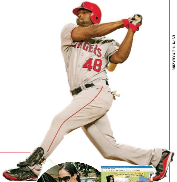
ESPN THE MAGAZINE